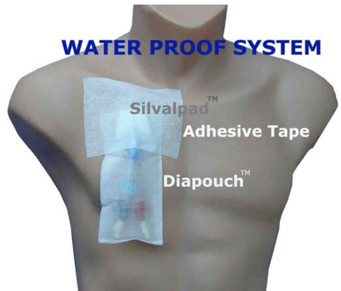
CATHETER PRESERVATION WATERPROOF PACK*