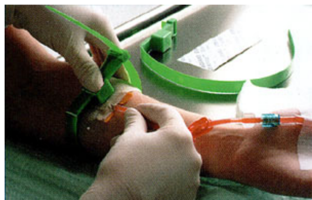
Place the "bath shaped" block of the armlet over the center pad, and remove the needle.

Pollak Ltd. Hamlacha 20, Rosh Ha'ayin, Afek, 48091 Israel. Tel: 972 3 9022885 Fax: 972 3 9024531 euroband@hotmail.com www.euroband.com