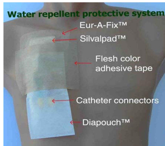
Water repellent system